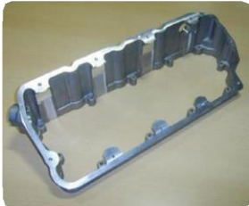
Valve Base Cover