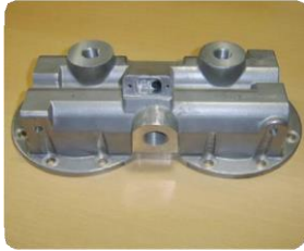
Dual Dryer Valve Hsng