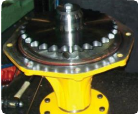
Wheel Hub Assembly