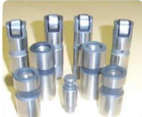
Aerospace Components Tappets